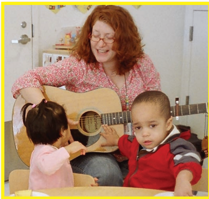
Children socialize, improve language skills and participate in activities that better prepare them for school.