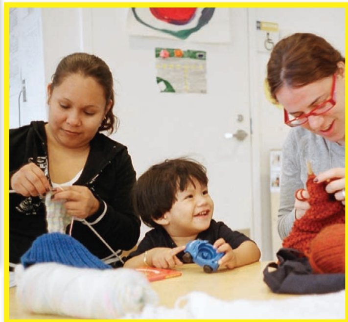
Parents participate in projects during the weekly group and share their experiences with Child Life staff and other parents.