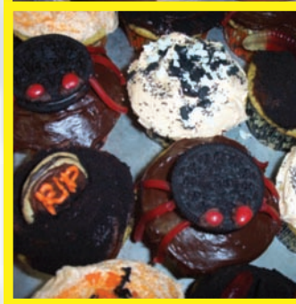
For Halloween, volunteers threw a pumpkin painting party for the children and teenagers in the 21st floor psychiatric unit. Colorfully decorated pumpkins and Halloween snacks made for a festive time.